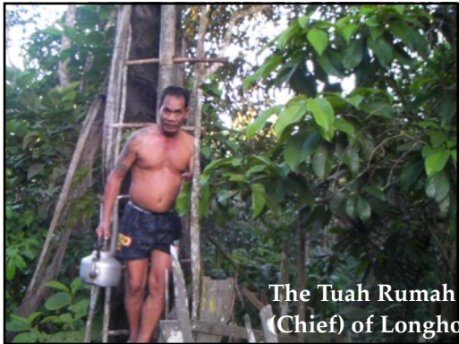
The Tuah Rumah (Chief) of Longho

Day 4 (B/L/D) Following breakfast depart the longhouse and go jungle trekking. Our destination is Tinting Empelau the lush forest where wild orangutans are occasionally spotted. Explore the rainforest and have lunch en route.